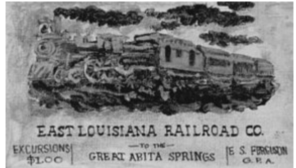
The railroad Plessy took.

You can probably guess that the cars for blacks weren't as nice as the cars for whites. Not only that, it seemed unfair to make black people sit separately. A group of citizens called the "Free People of Color in New Orleans" formed a committee dedicated to repealing this law. They convinced Homer Plessy, who was 7/8 white and 1/8 black, to test the law by sitting in a whites-only train car. When Plessy was asked to move, he refused and was arrested.